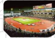
LA Memorial Coliseum and Exposition Park