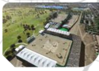
Sepulveda Basin Recreation Area